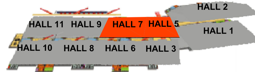
AsiaWorld-Expo Exhibition Hall Location 亞洲國際博覽館位置圖