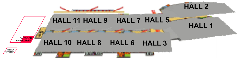
AsiaWorld-Expo Exhibition Hall Location 亞洲國際博覽館位置圖